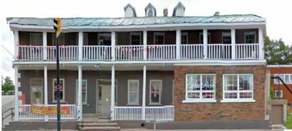
Harley's Pub & Perk - before