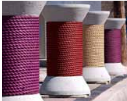
Needle & button - NYC, NY