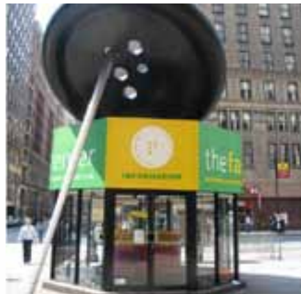
Spools - Hamilton, ON