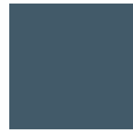
Grey Blue Pantone: 7546 C