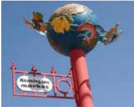
Kensington Market pole - Toronto, ON

The opportunity for the community of Ripley to create public spaces and displays of art, this will reflect the local talent and industries.