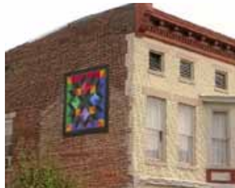
Example of Historic Mural